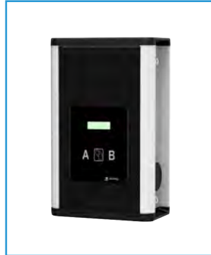
WallBox eVolve Smart