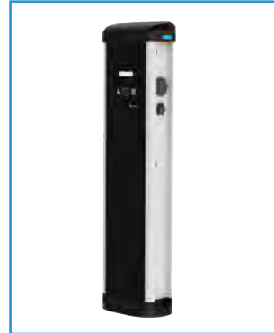
Post eVolve Smart